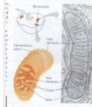
Figure 4.18 The mitochondrion

Mitochondria harvest chemical energy from food